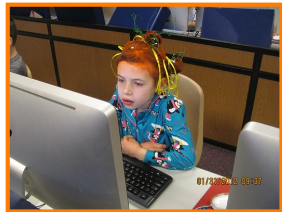
CRAZY HAIR DAY